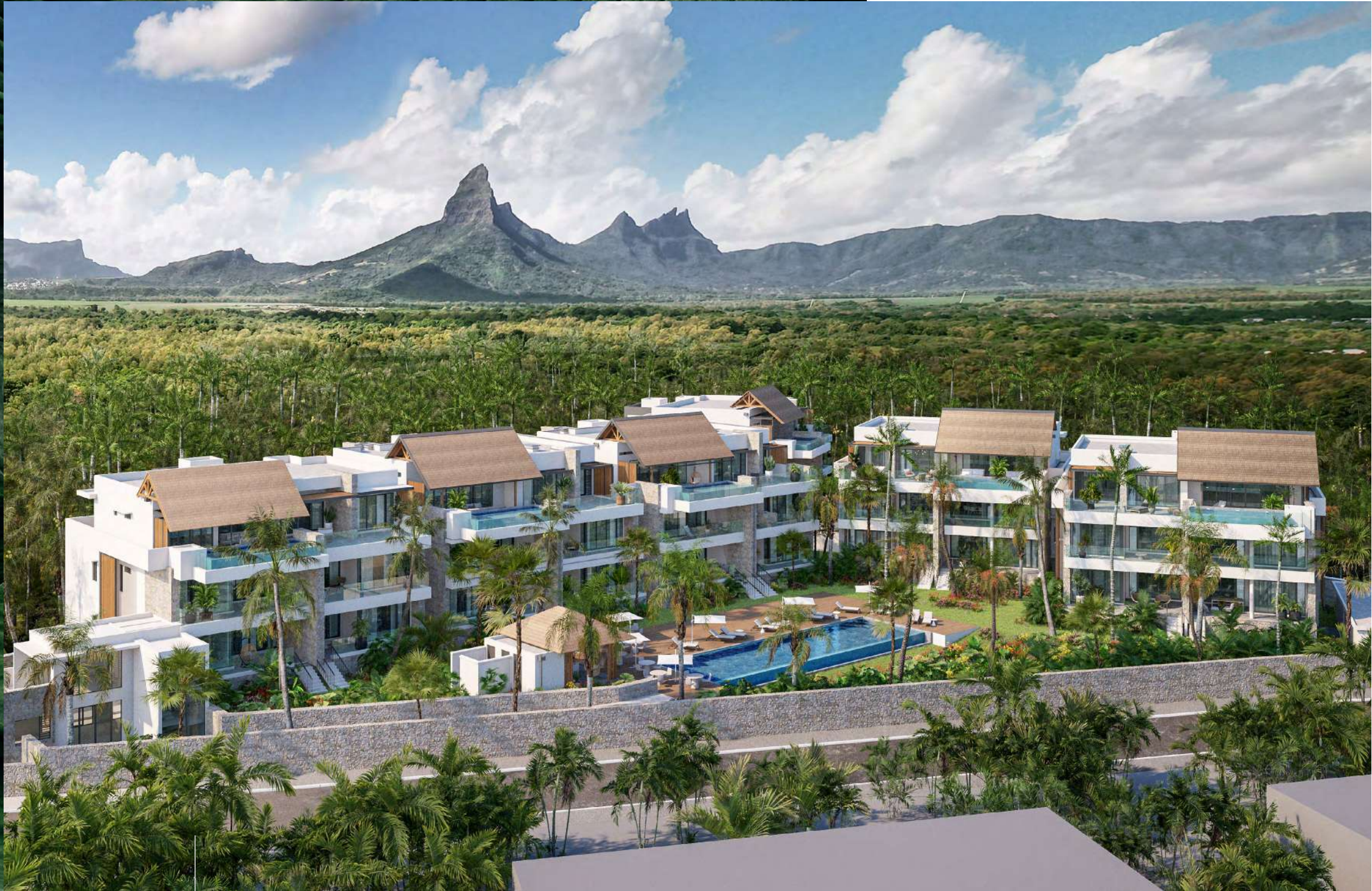
Aerial view of the 6 penthouses