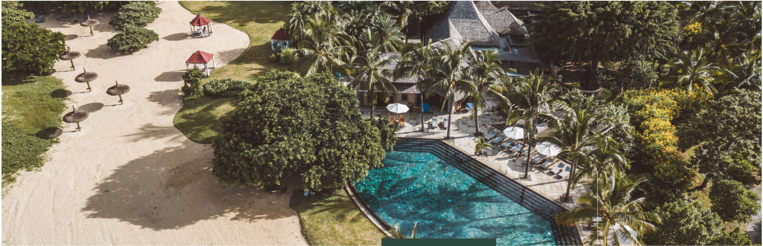
Shared and warmed swimming pool of Maradiva Villas, Resort and Spa.