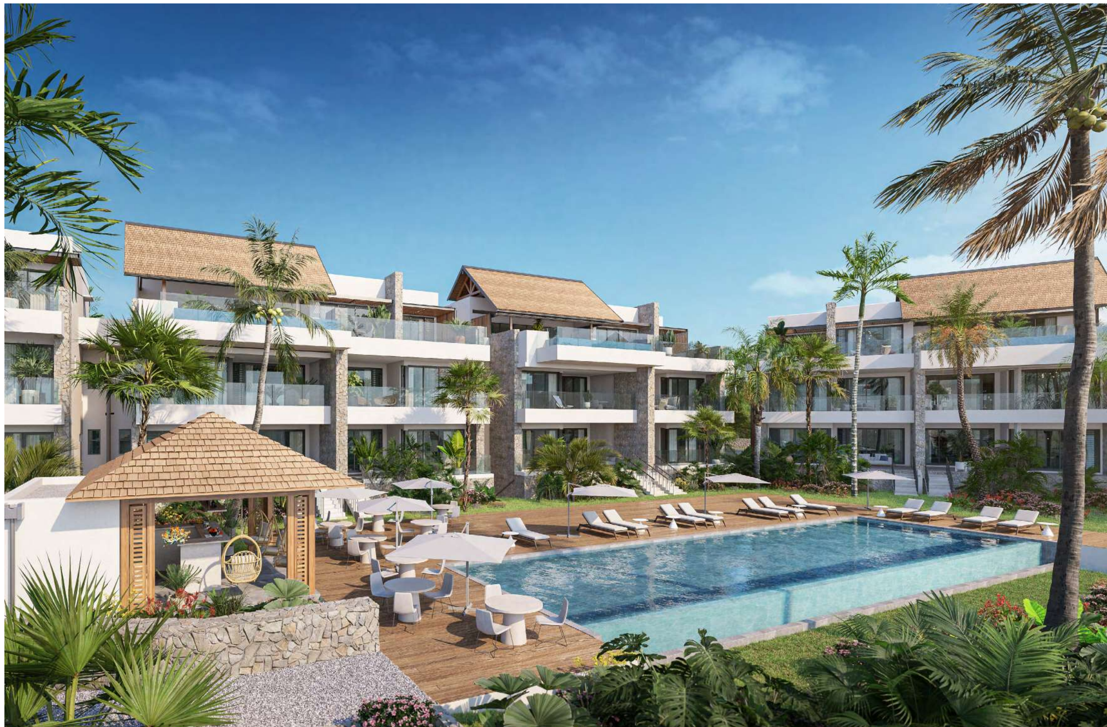
Serena Residences by Sands, main pool and pool bar