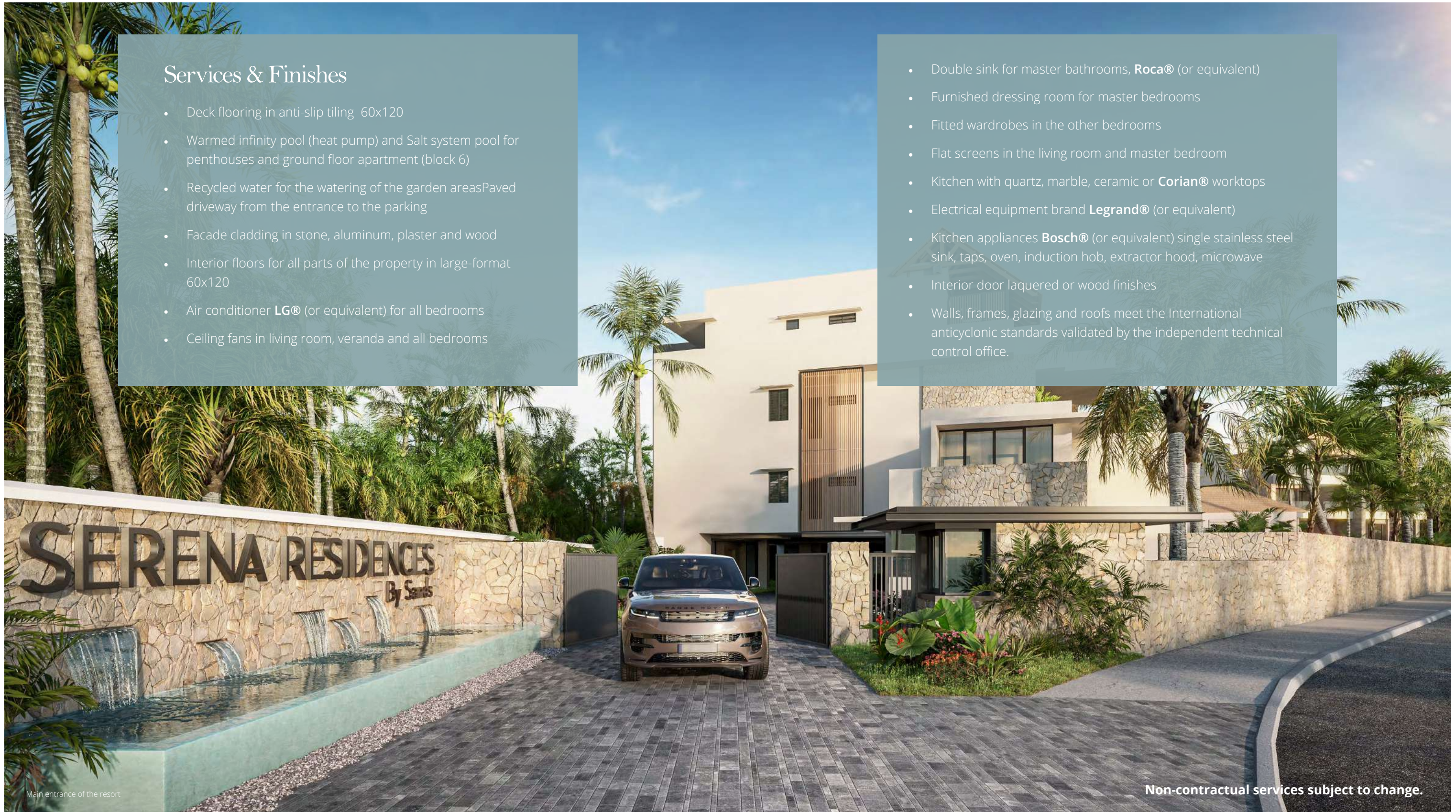
Main entrance of the resort

Non-contractual services subject to change.