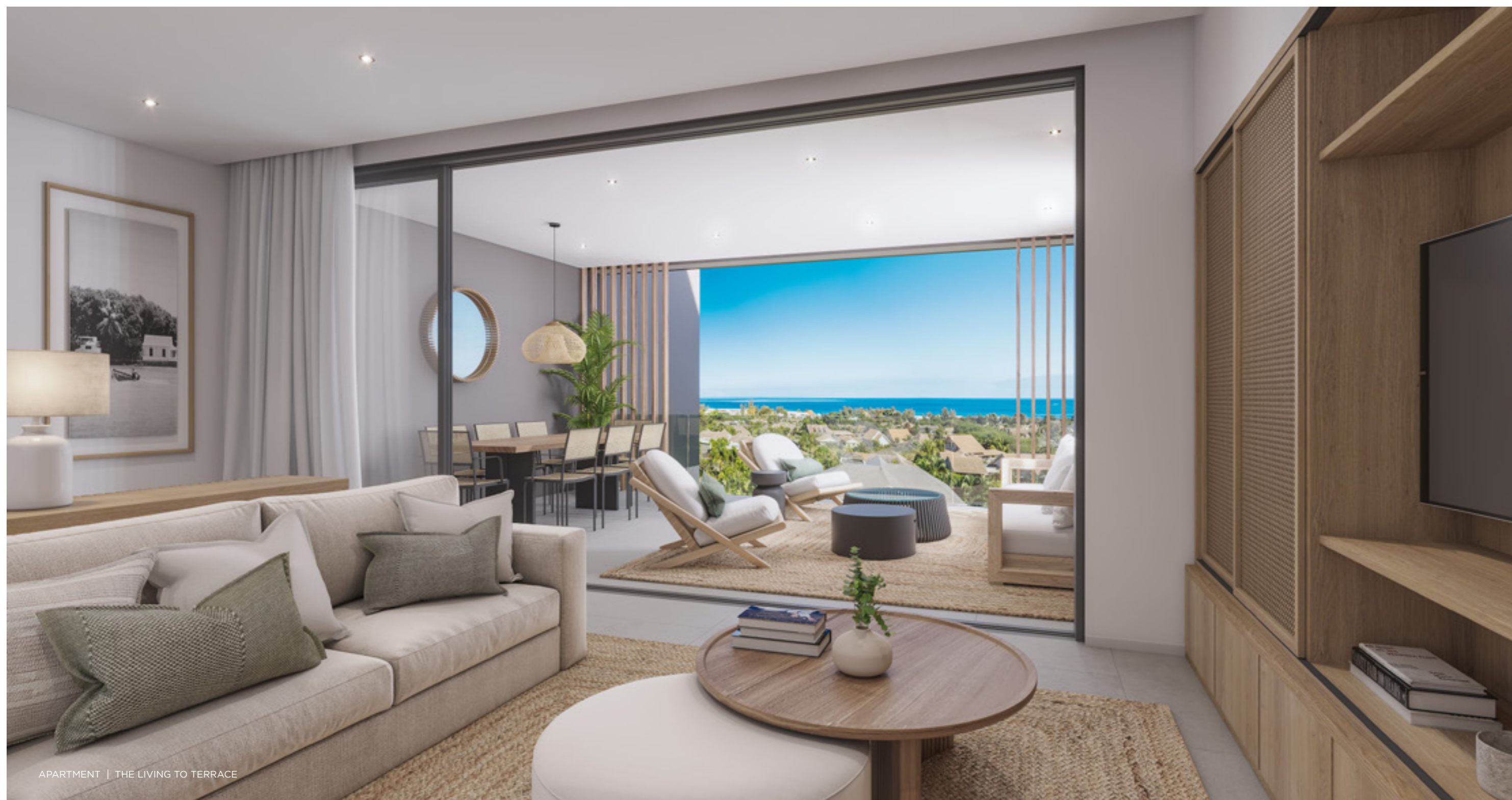
APARTMENT | THE LIVING TO TERRACE