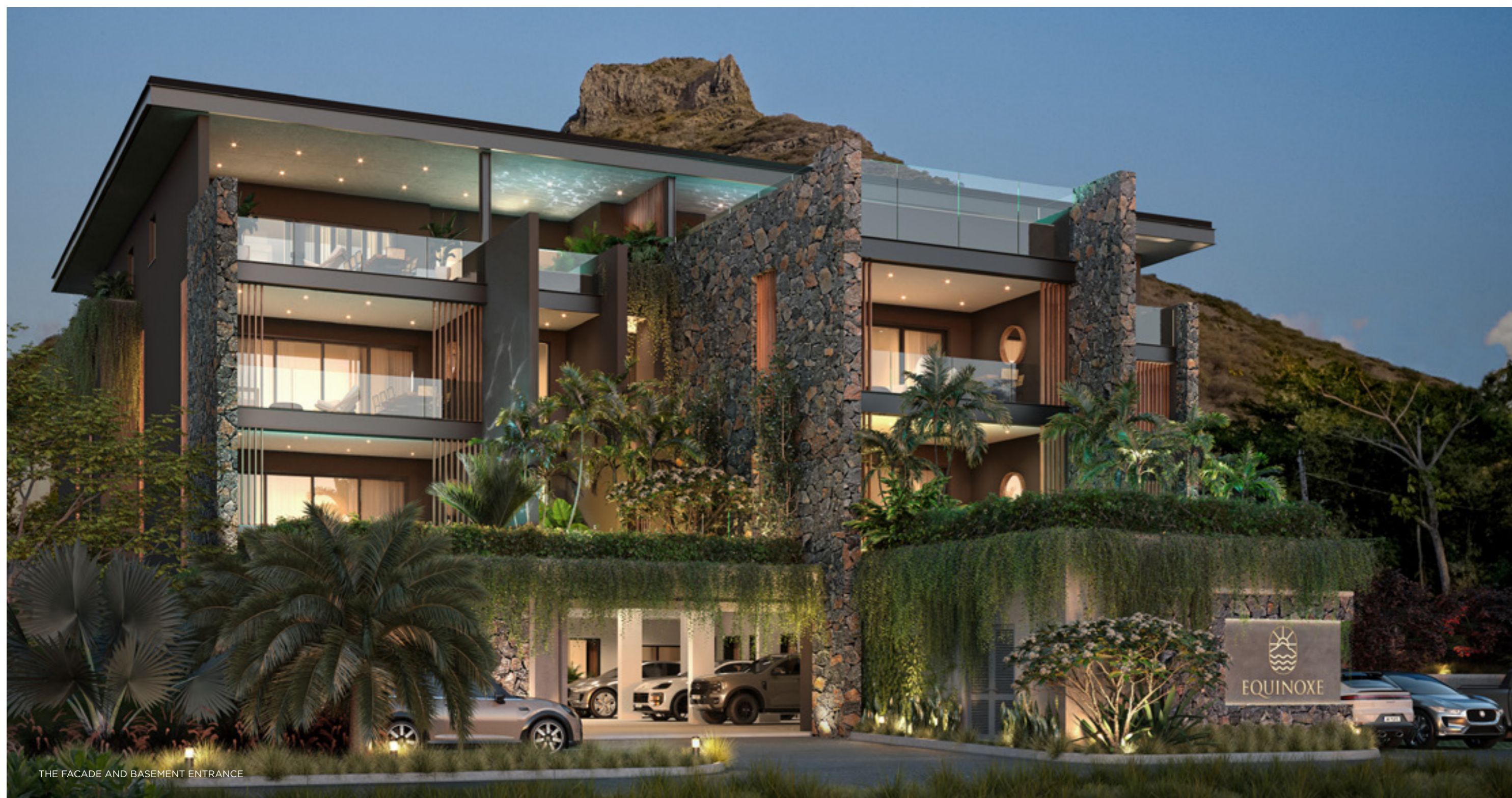
THE FACADE AND BASEMENT ENTRANCE