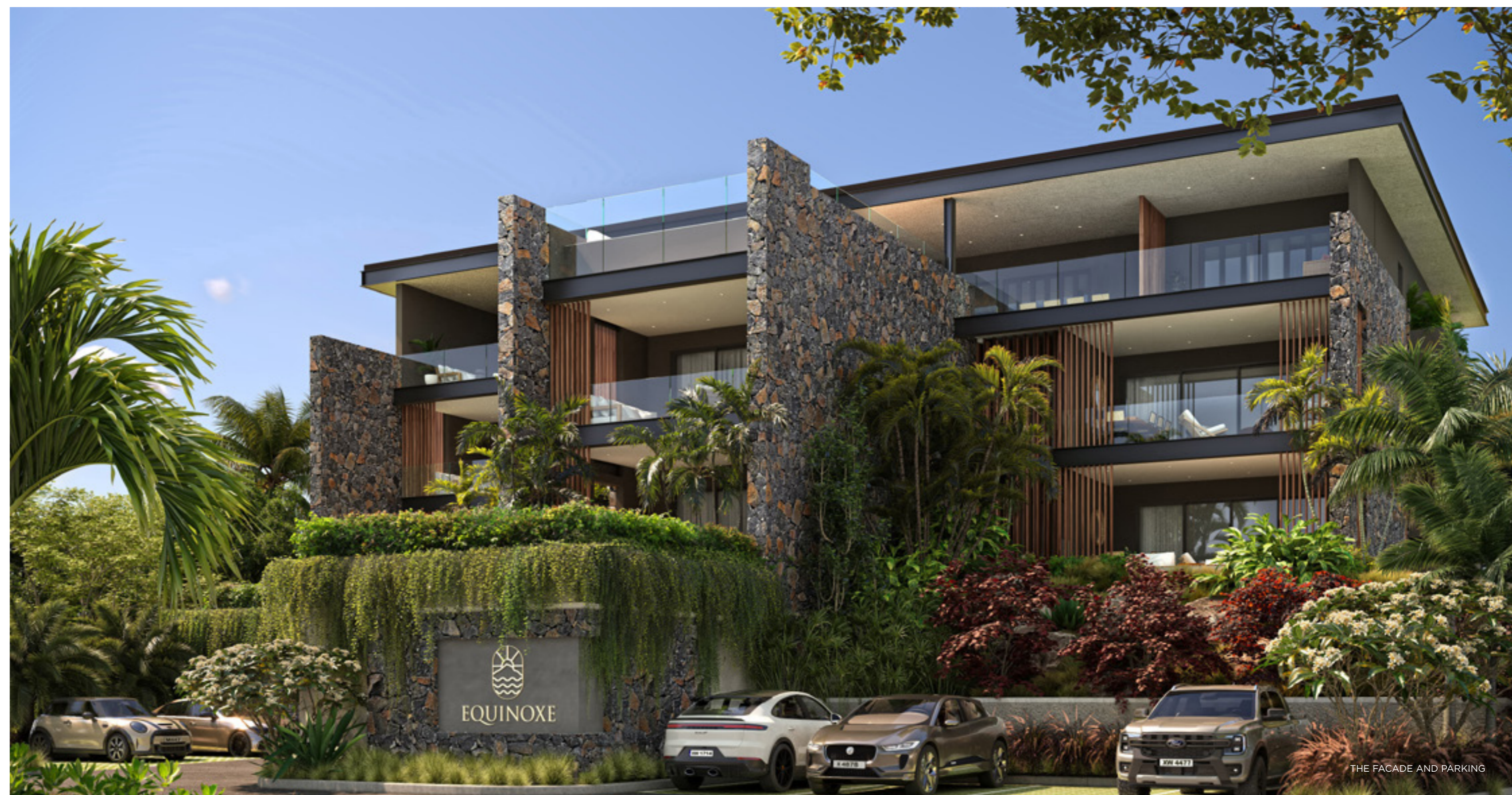
THE FACADE AND PARKING